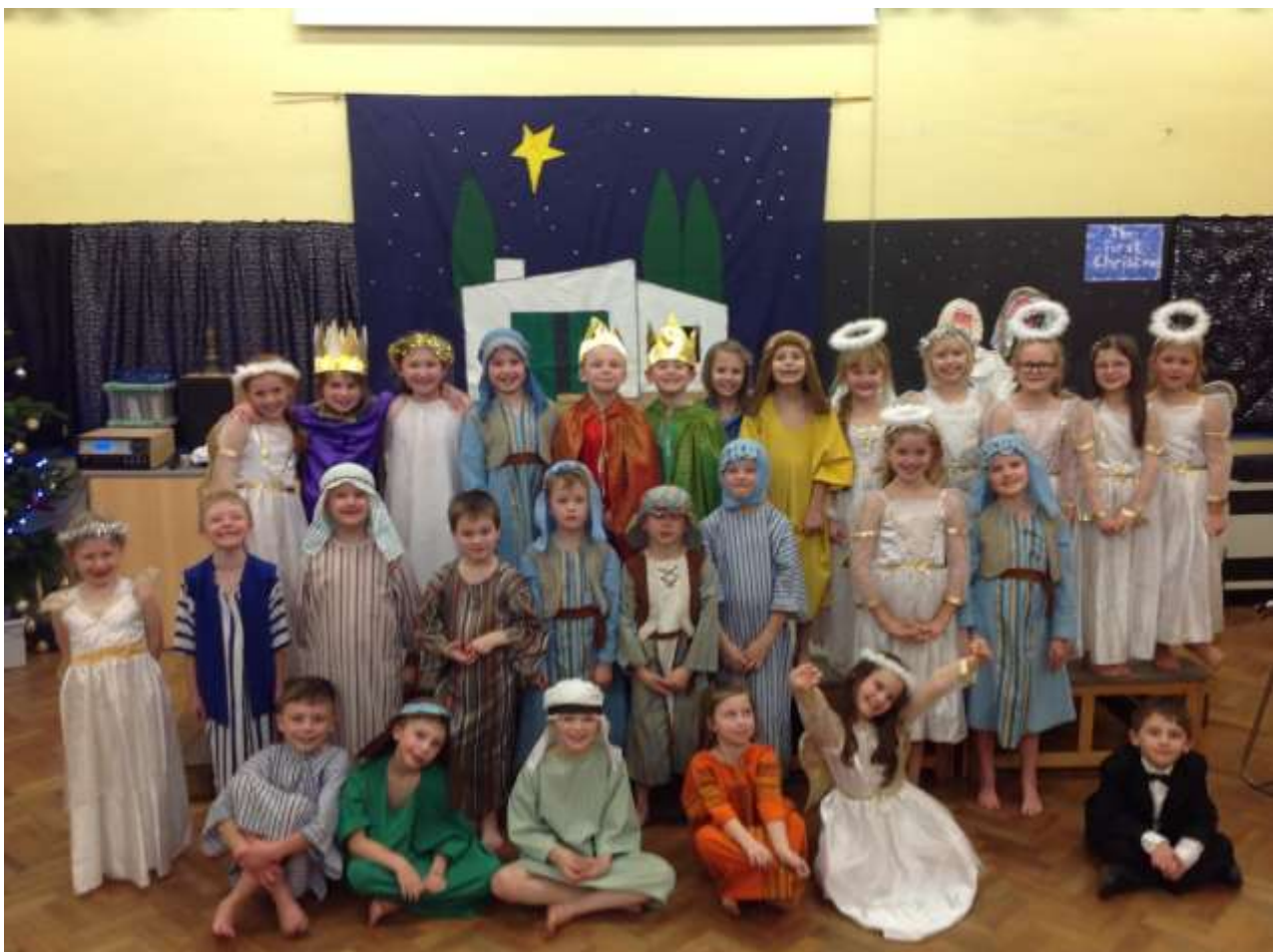
Y3 French Nativity Production

Thank you to all the parents and carers who came to our productions this week. We hope you really enjoyed them and felt proud of your children. Thank you to everyone, parents, teachers, staff who helped the children learn their lines and put such an effort into them.